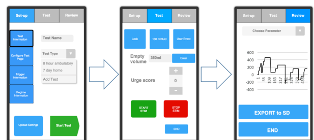
Figure 1. Initial designs for User Interface. From left to right - 1. Parameter and information input 2. Patient diary and control interface 3. Review and export window

The user interface, delivered through a smart device based app, functions in three modes (illustrated in figure 1). First for the researcher or clinician to input the stimulation regime and trigger type they wish to implement along with relevant test information. This is loaded from the user interface to the controller, to complete the stimulation algorithm. Secondly, it offers a patient interface to be used for stimulation on-off control and diary entry of relevant information. Thirdly to collate the diary and stimulation data captured for a post test review and export. This data will be time-stamped in sync with simultaneously recorded ambulatory urodynamic data to allow review of stimulation tests against objective data.